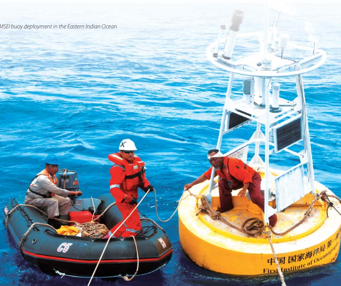
MOMSEI buoy deployment in the Eastern Indian Ocean

Meanwhile, the "WESTPAC Best Young Scientist Award" has proven to be a valuable means to encourage young scientists to engage in international scientific collaborations. Participants therefore strongly recommended WESTPAC to continuously selecting the best young scientists for this award in the future symposia.