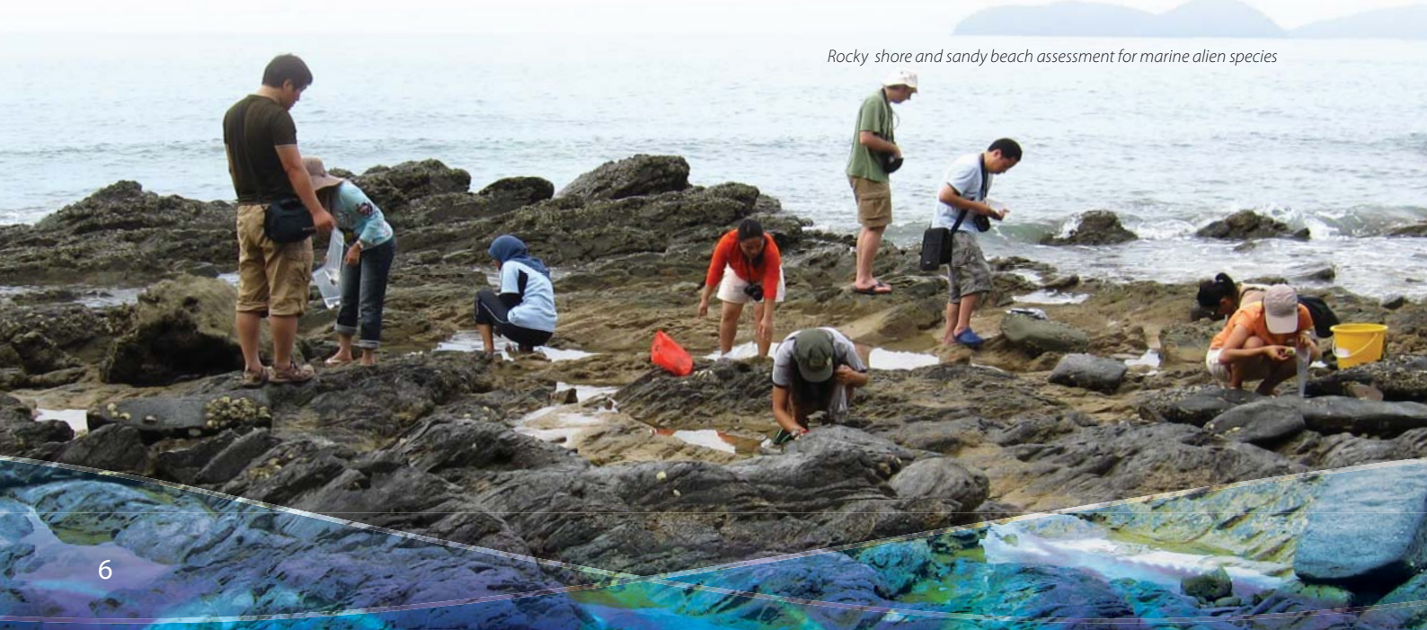
Rocky shore and sandy beach assessment for marine alien species

Participants recognized the critical role and socio-economic importance of the Western Pacific and its adjacent regions which constitutes one major influence on regional & global climate system, the epicenter of the world marine biodiversity, spawning and nursery grounds for diverse marine species, a potential reservoir of non-living resources, and a treasure sustaining over one-third of the world's population.